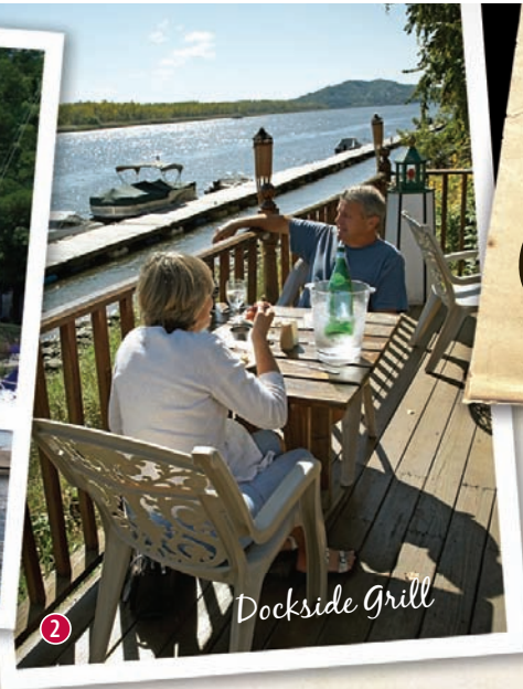
2 Dockside Grill