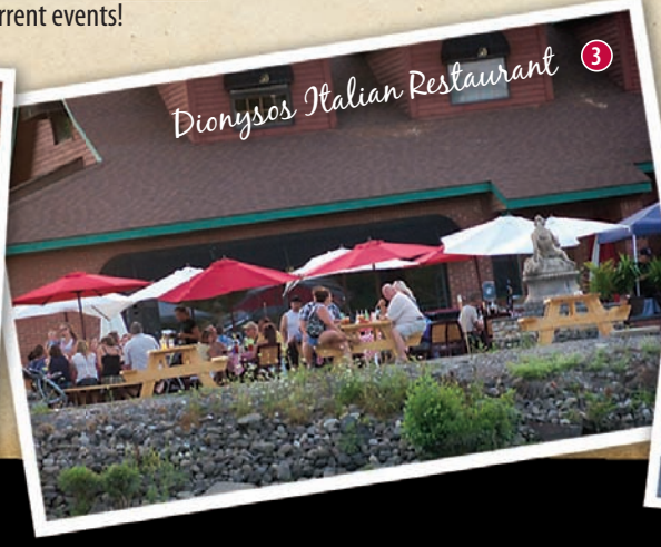
3 Dionysos Italian Restaurant