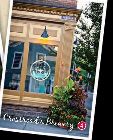
4 Crossroad's Brewery