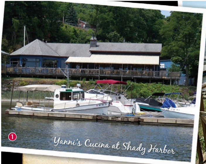
1 Yanni's Cucina at Shady Harbor