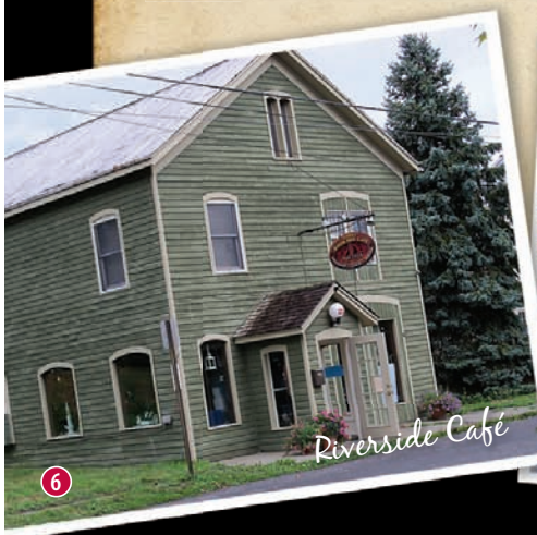
6 Riverside Café