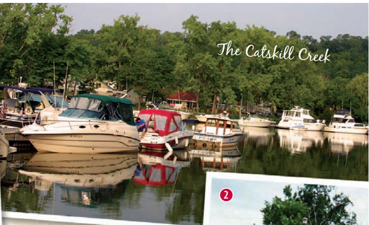
The Catskill Creek