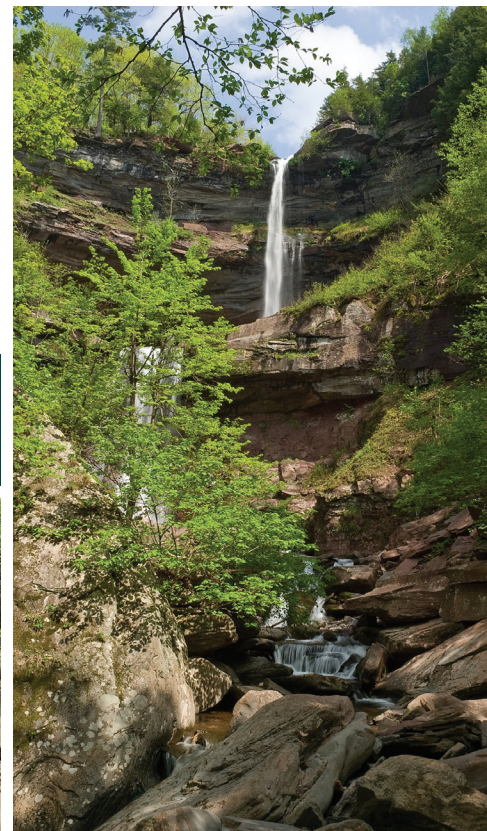
Kaaterskill Falls – Highest cascading waterfall in NYS